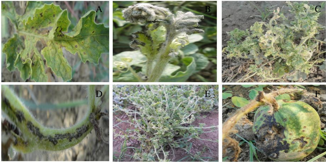
Fig.1 Symptoms of Watermelon bud necrosis virus (WBNV) in watermelon under field conditions A: necrotic spots on leaves; B: bud necrosis; C: stunted growth of the plant D: stem necrosis; E: shortened internodes and F: deformed fruit with necrotic spots