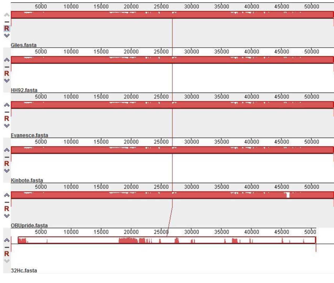
Fig. 3. progressiveMauve alignment (2) of the genomes of Mycobacterium phage Giles, the phages which are strains of this virus (HH92, Evanesce, Kinbote, OBUpride) and the related isolate 32Hc, which is not part of the new genus. Colored blocks indicate the regions of 1 to 1 best alignment with rearrangement breakpoints in a different random color. The degree of sequence similarity between regions is given by a similarity plot within the colored blocks with the height of the plot proportional to the average nucleotide identity (Aaron Darling, personal communication).